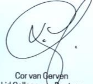
Lid College van Bestuur